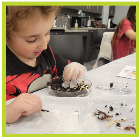
Exploring some compost!

In October, the Aggies broke the ice by playing games to get to know one another. They also painted pumpkins to get into the spooky spirit.