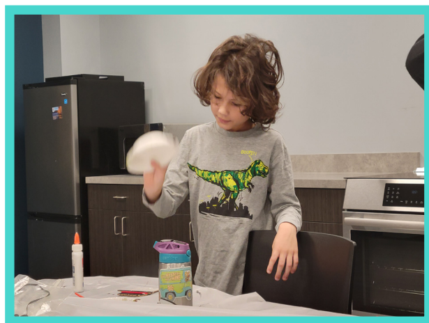
Using a plate to fan his craft dry!

For the final meeting of 2022, the Aggies created snowman door hangers out of popsicle sticks. They also decorated sugar cookies and had a cookie swap. Each member was asked to bring homemade cookies so they could trade them at the end of the meeting. The Junior Teen Council assisted at this very busy meeting.