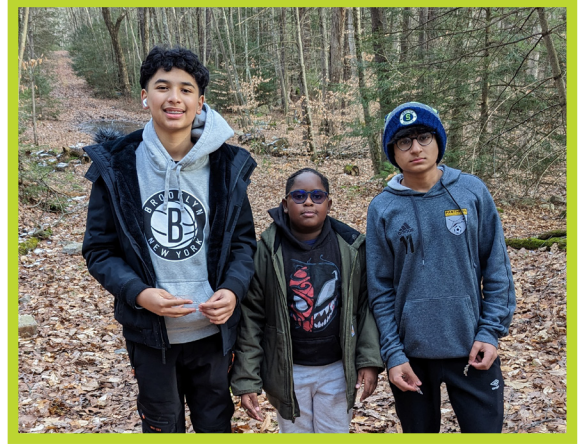
Long hike at Winter Camp

There will be 10 STEM Ambassadors from Passaic County attending Summer Science Kick-Off Week at Rutgers University in New Brunswick, NJ from July 10 th to 14 th , 2023.