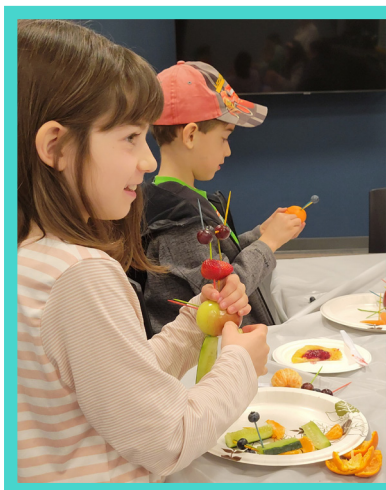
Creating healthy living monsters out of fruits and vegetables