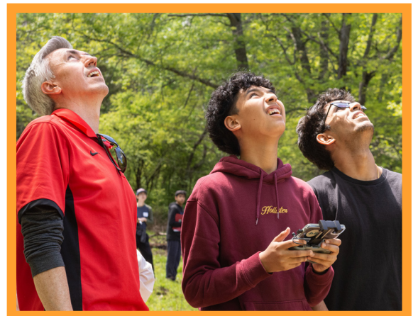
Drone Forest Management Program