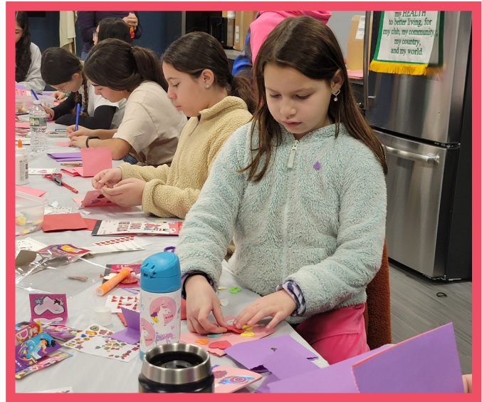
Making Valentine’s Day cards!