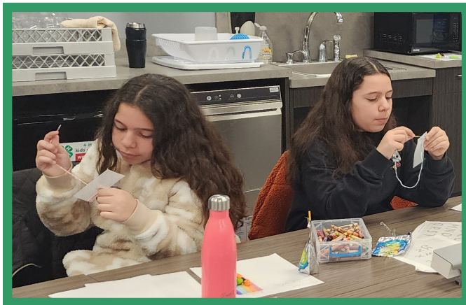
Learning to cross stitch!