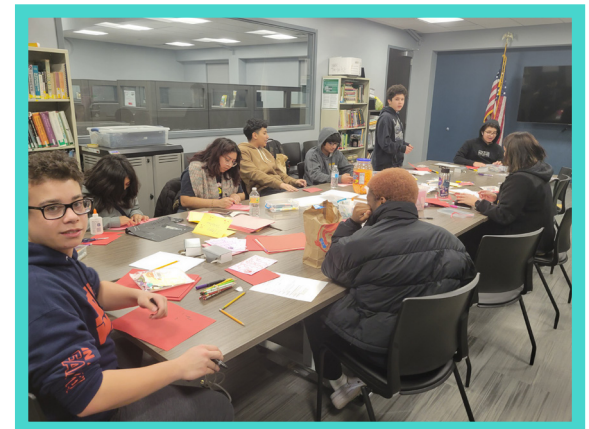
Making Valentine's Day cards!