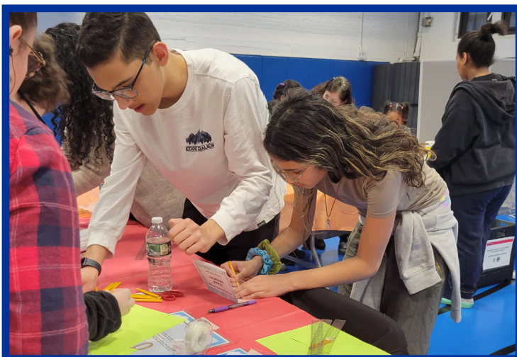
Making Hoop Glider at PS 2 Family STEAM Event

The STEM Ambassadors will be meeting at the Clifton Public Library on the 2 nd Wednesday of the month for the 2022-23 Club Year.