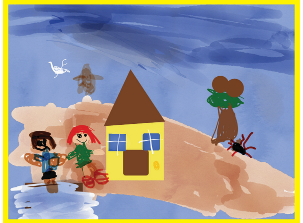
Landscape by Alexander