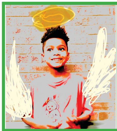
PopArt by Aiden